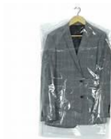
Dry Cleaning Bags