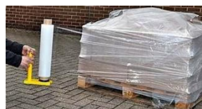
Pallet wrap & Stretch Film