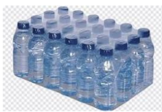
Case Wrap Sleeves